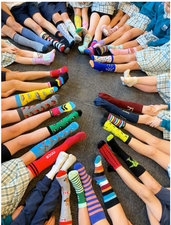
Above: Odd Socks Day at Galilee